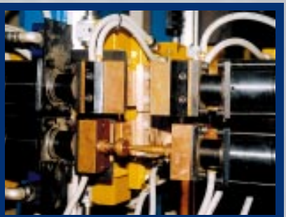
Bar or Spot Welding Electrodes