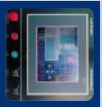
Windows Based Industrial PC