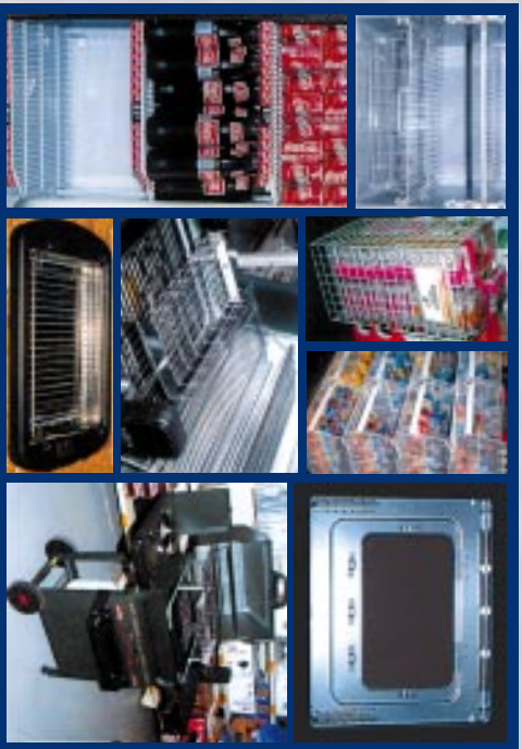
Typical Versaweld Products